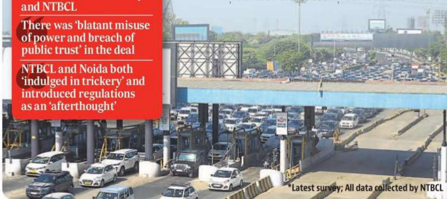
*Latest survey; All data collected by NTBCL

250,000 estimated vehicular traffic on DND in 2018*